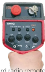
Standard radio remote control