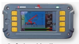
Safe load indicator