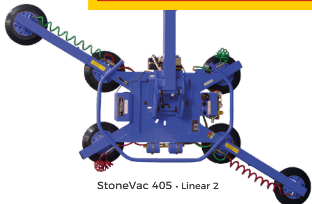
StoneVac 405 • Linear 2